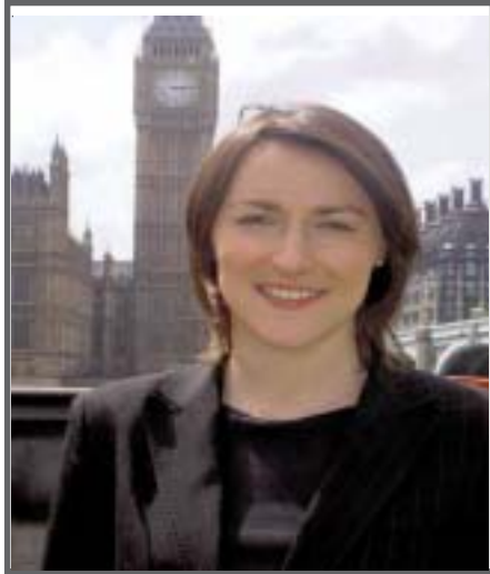
Julia Goldsworthy MP

WLD congratulates the talented women in the party on their recent promotions. Here we feature some of their biographies. The WLD website now has a live feed from most of our women MP's news pages. So if you want to see what our women MPs are up to this week, check out our website www.womenlibdems.org.uk